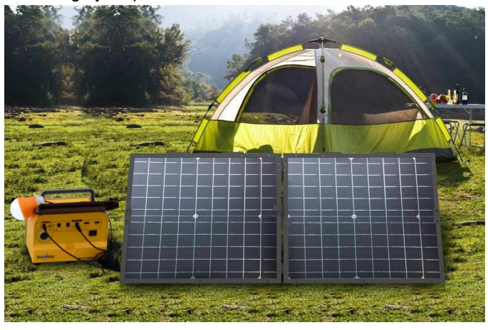
Attention: Please make sure nothing pressed on solar pallet.