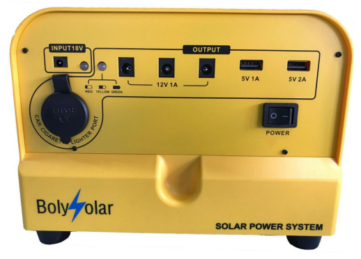
Mobile Power Bank